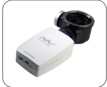
Firefly Digital Camera +Beam splitter

It's easy to upgrade your S360/S360S to a Digital Slit Lamp with Firefly Digital Module Kit (Firefly Digital Camera, Beam Splitter, MediView Software, USB Cable, Background Illumination Module)