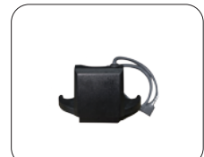
Background Illumination Module