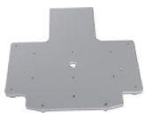
Metal Plate (work with refraction units)